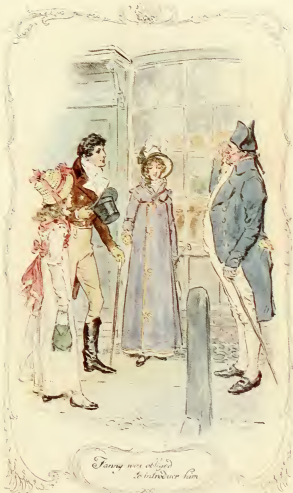
Fanny was obliged to introduce him