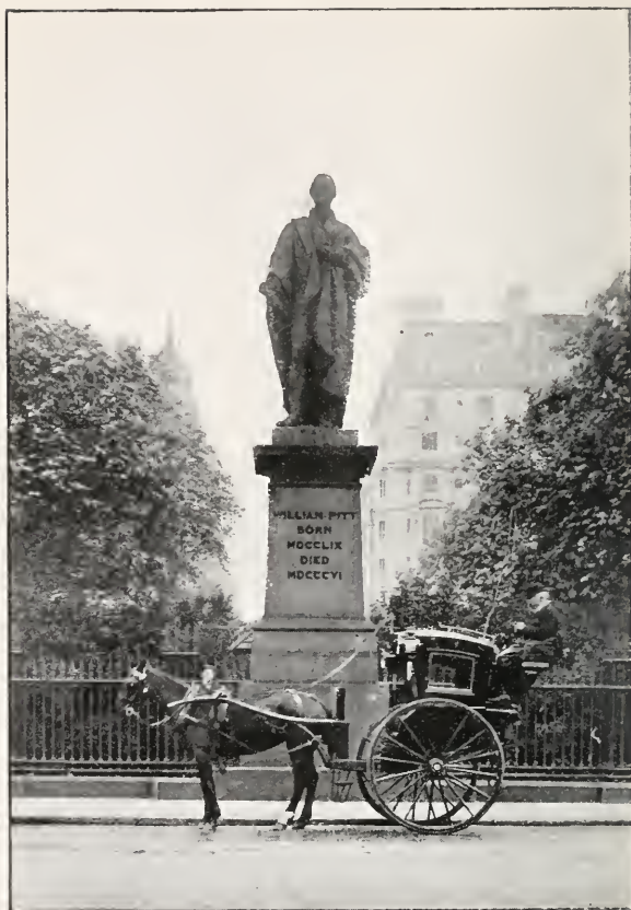
WILLIAM PITT, HANOVER-SQUARE. (See p. 41.)