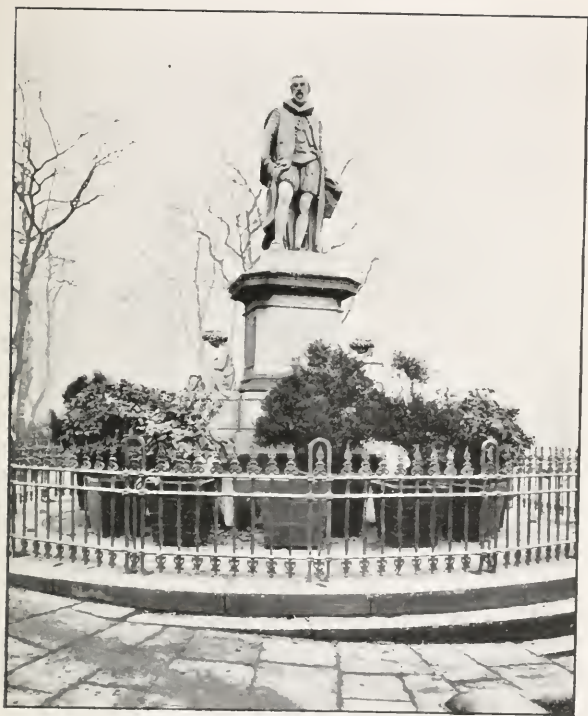
SIR HUGH MYDDELTON, ISLINGTON-GREEN. (See p. 37.)