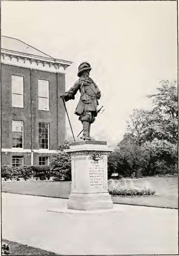
WILLIAM III., GROUNDS OF KENSINGTON PALACE. (See p. 57.)