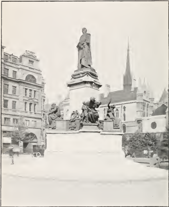
W. E. GLADSTONE, STRAND. (See p. 26.)