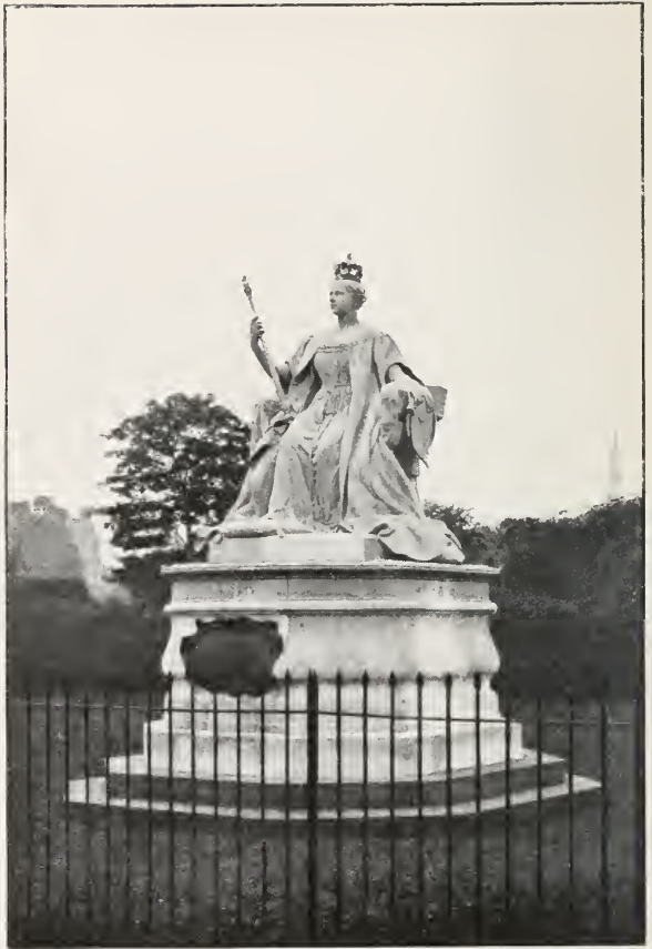
QUEEN VICTORIA, KENSINGTON-GARDENS. ( See p. 52. )