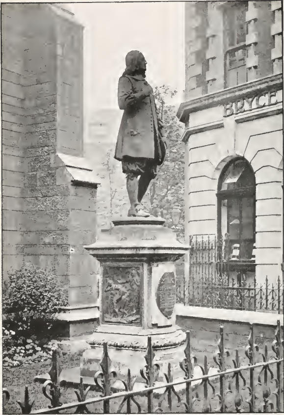
JOHN MILTON, CRIPPLEGATE. (See p. 36.)