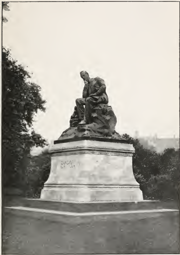
LORD BYRON, HAMILTON-GARDENS. (See p. 14.)