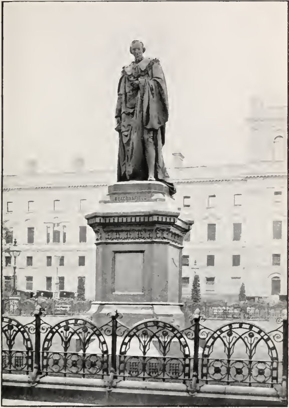
EARL OF BEACONSFIELD, PARLIAMENT-SQUARE. (See p. 10.)