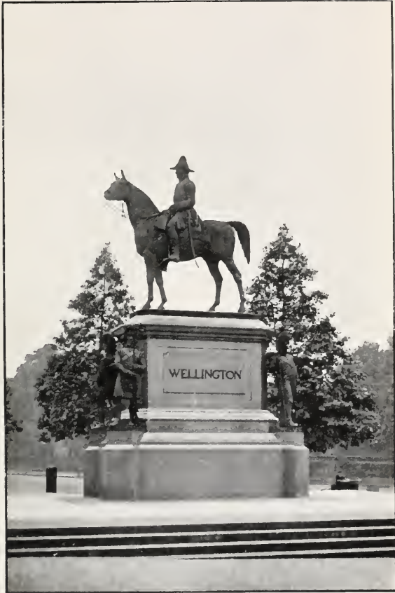
DUKE OF WELLINGTON, HYDE-PARK-CORNER. (See p. 55.)