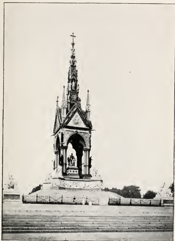
ALBERT MEMORIAL, KENSINGTON-GARDENS. ( See p. 7. )