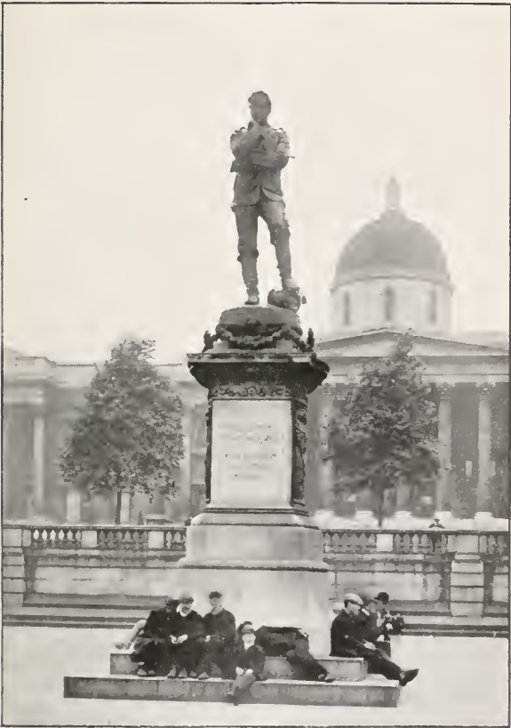
GENERAL GORDON, TRAFALGAR-SQUARE. (See p. 27.)