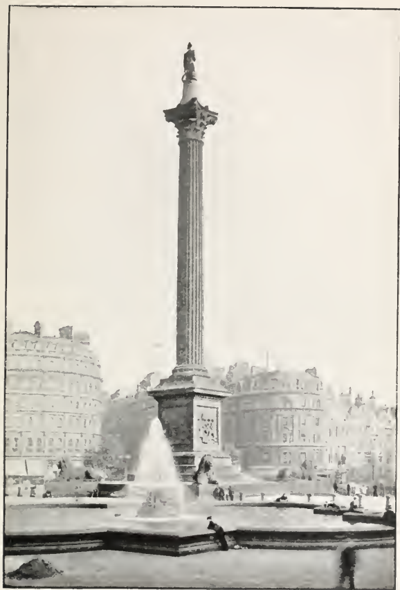
NELSON COLUMN, TRAFALGAR-SQUARE. (See p. 38.)