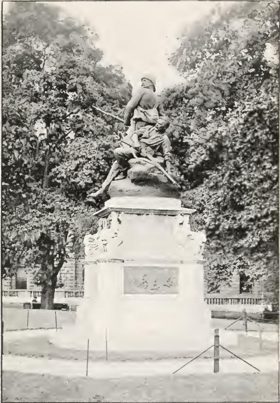
ROYAL MARINES, ST. JAMES'S-PARK. (See p. 35.)