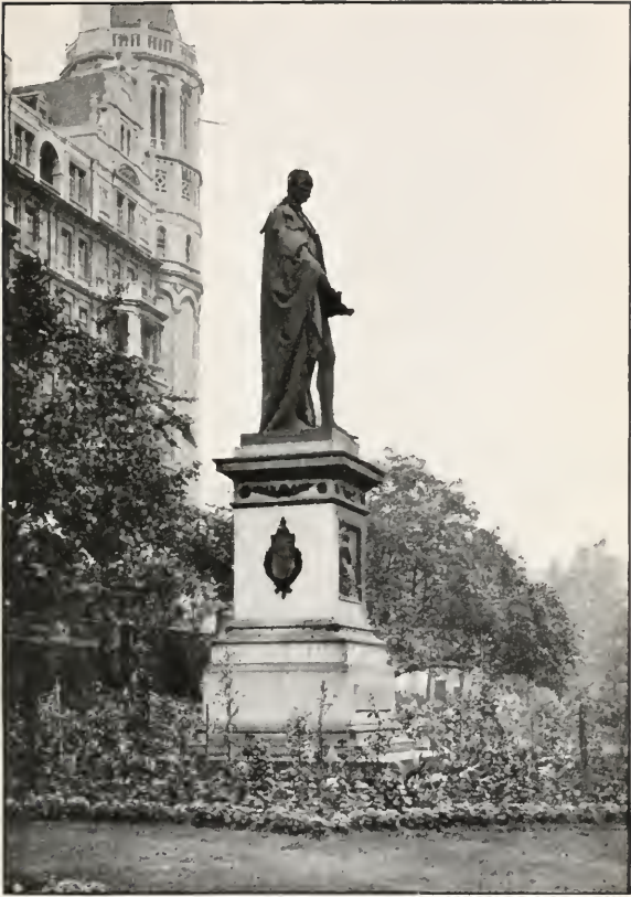
SIR BARTLE FRERE, VICTORIA-EMBANKMENT-GARDENS. (See p. 24.)