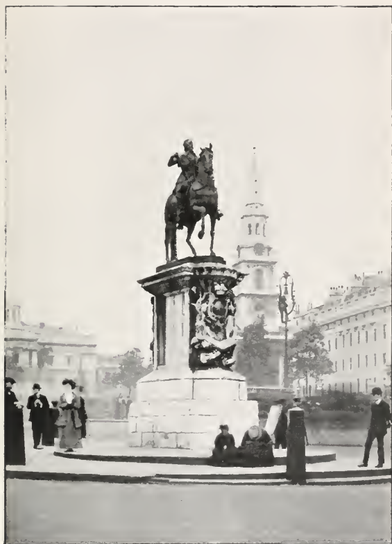
CHARLES I., CHARING-CROSS. (See p. 15.)