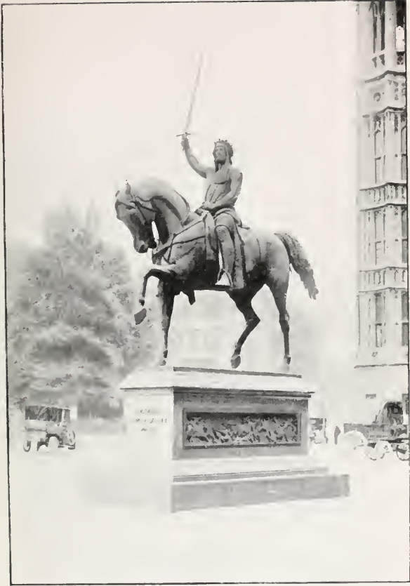
RICHARD I., OLD PALACE-YARD. (See p. 4.)