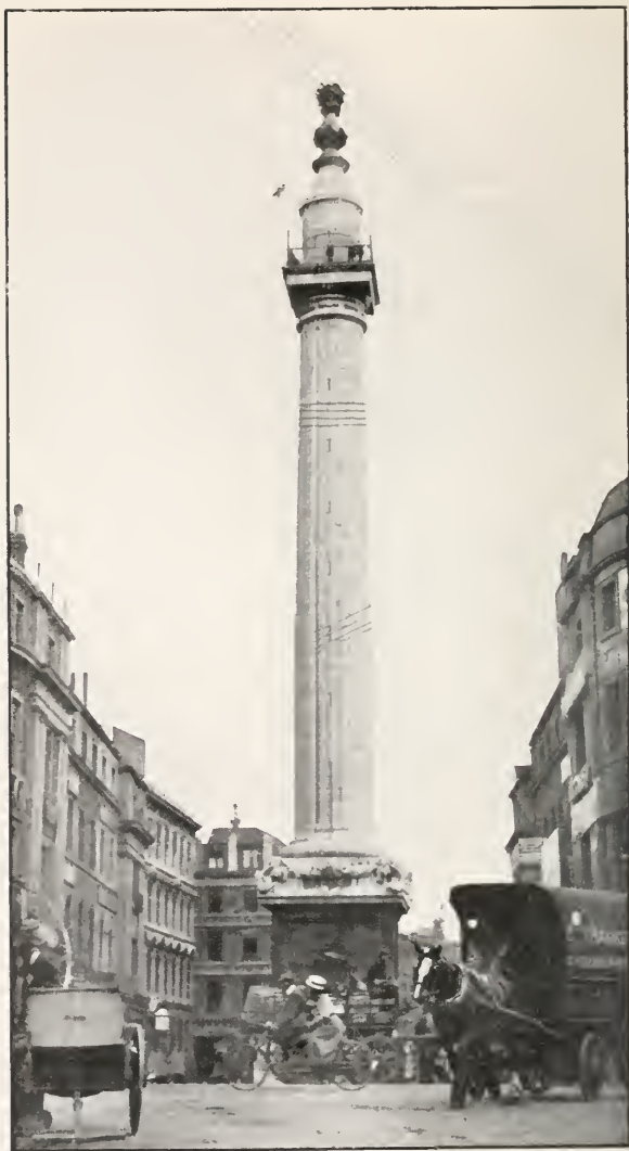
THE MONUMENT. (See p. 37.)