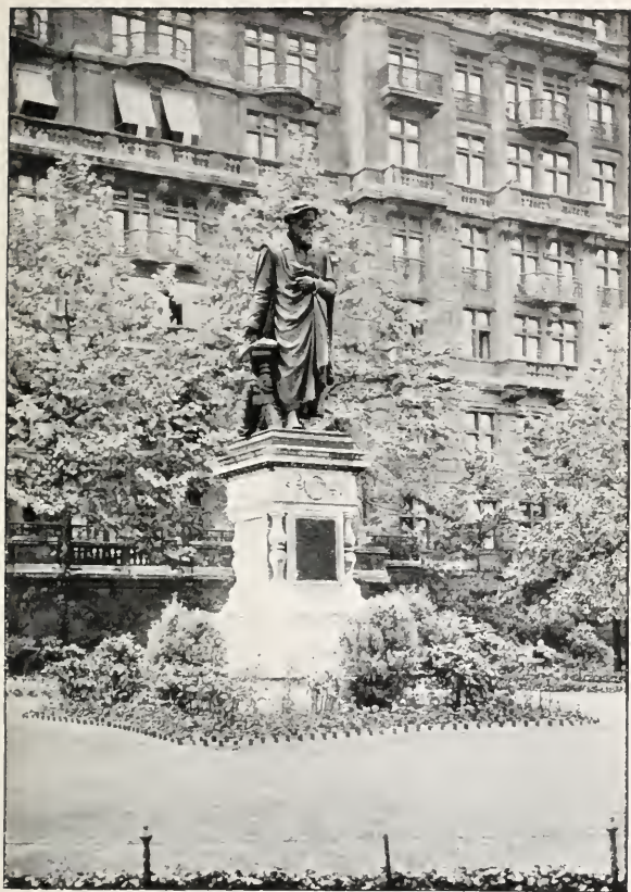
WILLIAM TYNDALE, VICTORIA-EMBANKMENT-GARDENS. (See p. 51.)