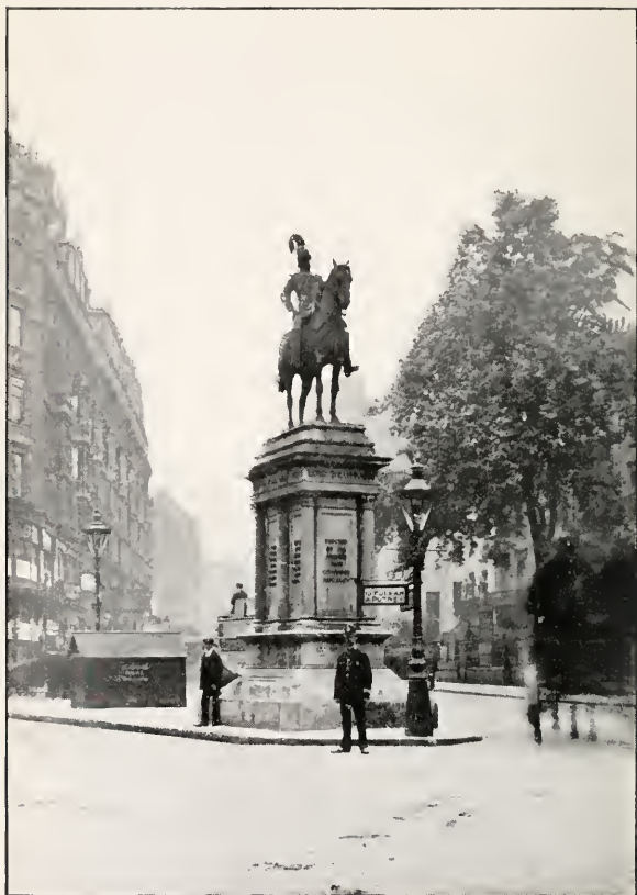
LORD STRATHNAIRN, KNIGHTSBRIDGE. (See p. 49)