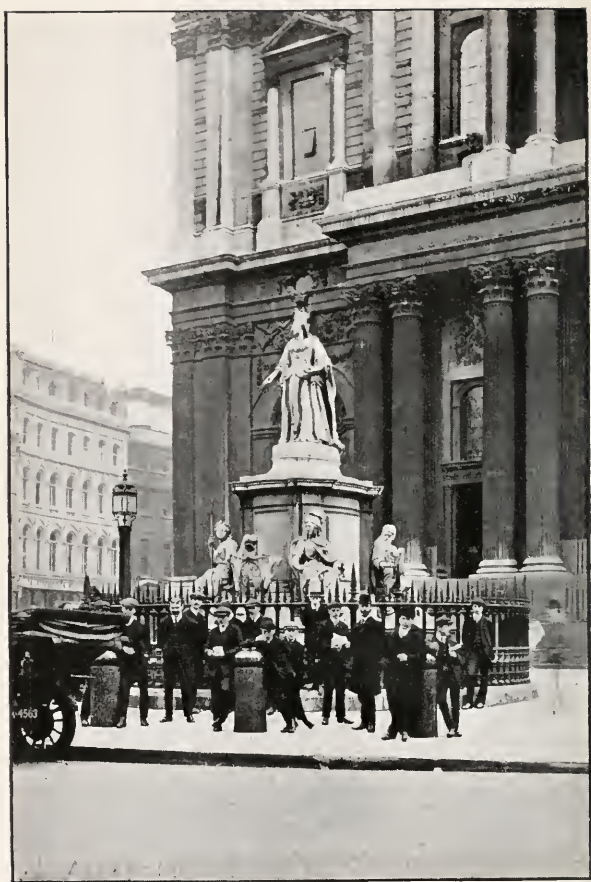
QUEEN ANNE, ST. PAUL'S. (See p. 9.)