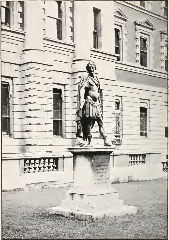
JAMES II., ST. JAMES'S-PARK. (See p. 32.)