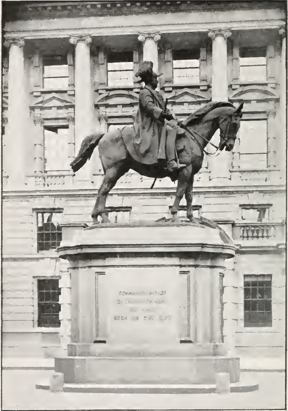
DUKE OF CAMBRIDGE, WHITEHALL. (See p. 14.)