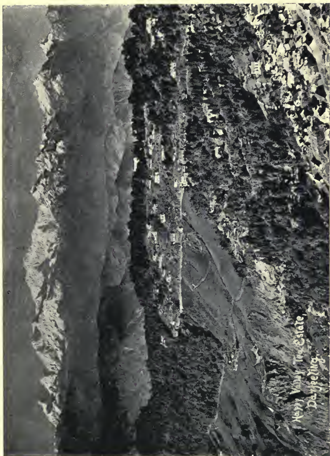
THE HAPPY VALLEY TEA ESTATE, DARJEELING.

In the left lower centre, near the right bottom corner of the forest, is the "HOMESTEAD."