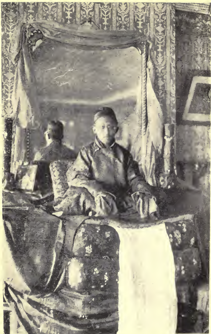
THE TASHI LAMA.

“His Holiness—a holy man,— Smooth, attitudinarian ; Upraised on improvised, silk throne, Sat calm, complaisant, all alone.”