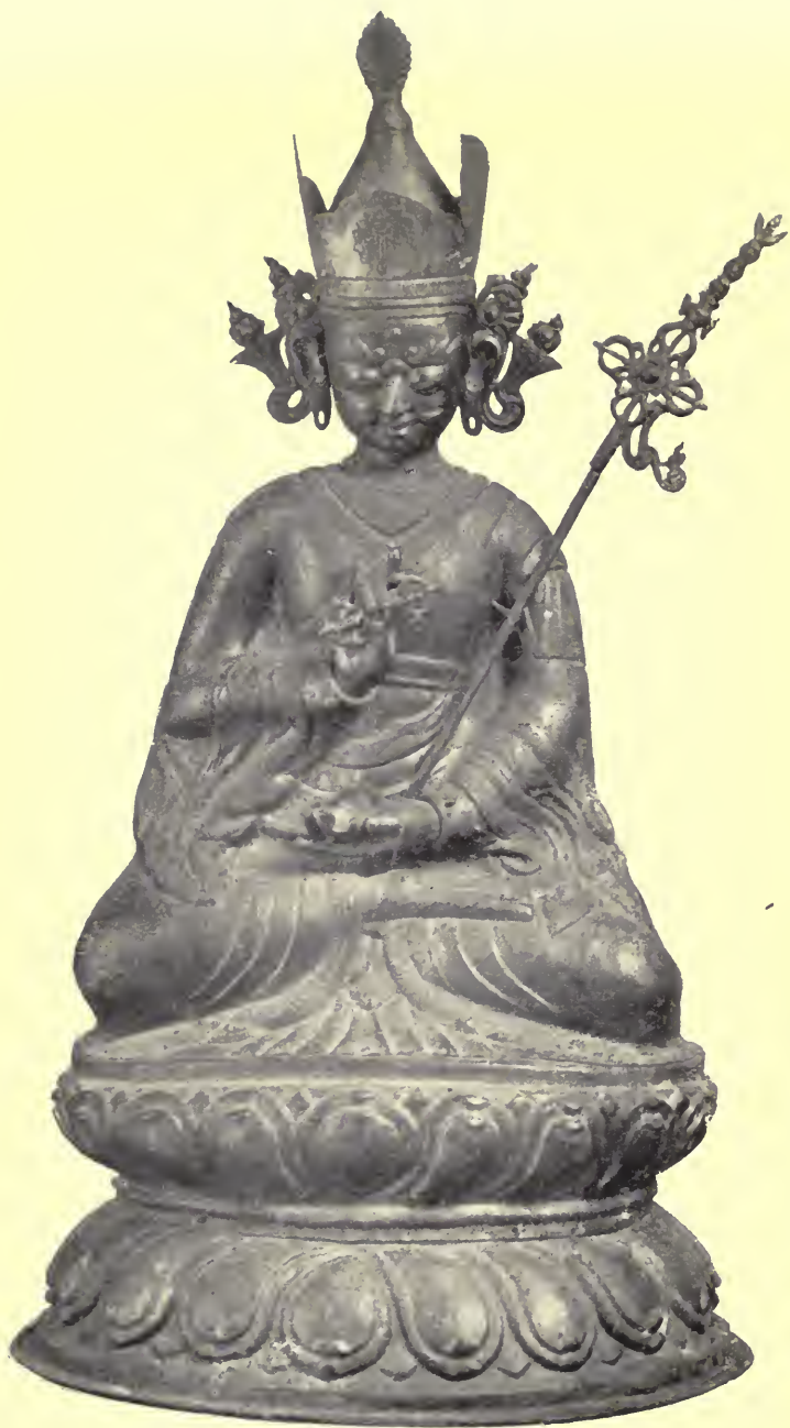
A TIBETAN BUDDHA.

The Buddha, in sheet brass, is holding a dorjé with the two centre fingers of the right-hand. A skull bowl rests in the left. The crozier bears on its staff a trinity trident, three skulls, a pair of wings, and a triple cross !