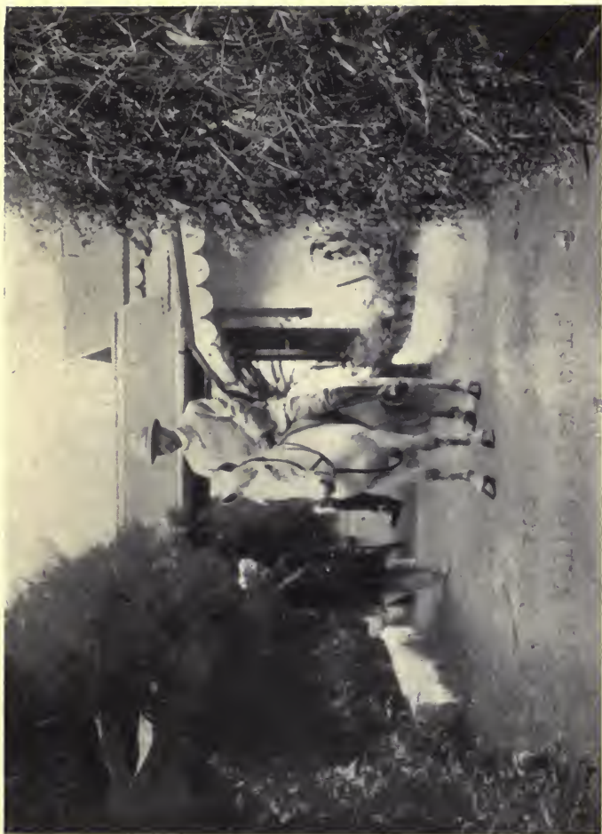
The "HOMESTEAD" Porch, and Bamboo Avenue, Happy Valley.

"We are off, round the Mall, to Gymkhana's fine club."