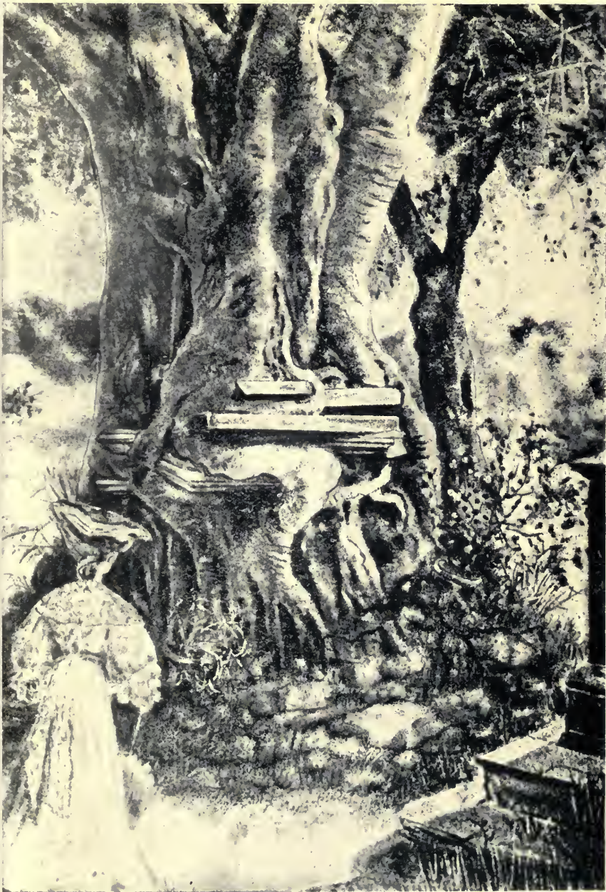
AGRA'S GREAT PEEPUL TREE.

From a large picture by the author's daughter, Millie.